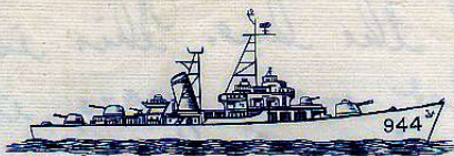
U.S.S. MULLINNIX DD-944